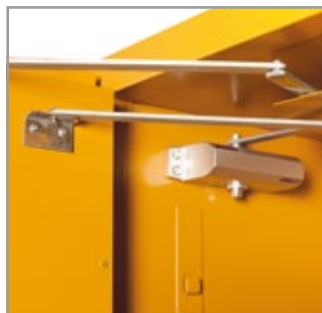
Sequential Self Closing Doors