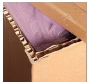
Heavy Duty Packaging