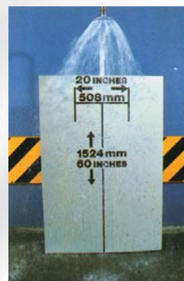
COMPETITOR Water not evenly dispersed