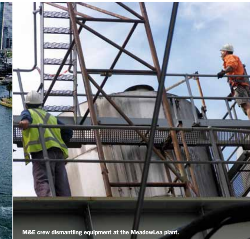
M&E crew dismantling equipment at the MeadowLea plant.