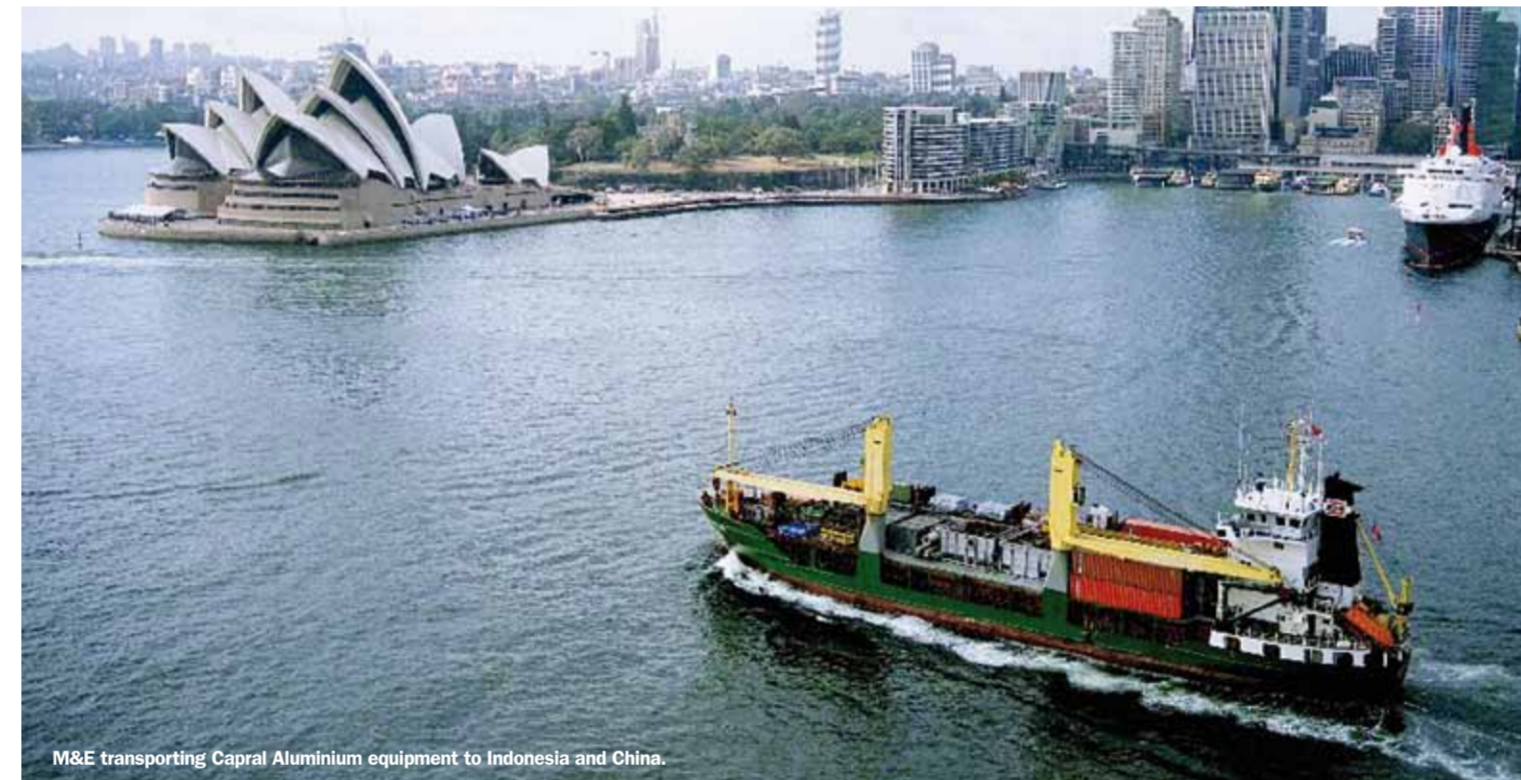
M&E transporting Capral Aluminium equipment to Indonesia and China.

When Kodak closed down its Australian operation the massive removal job went to M&E: stripping out every piece of equipment in 12 buildings set on 77 hectares.